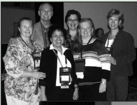
2006 Pennsylvania Delegates at the Atlanta National Convention.

Doesn't your body deserve the best? By buying organic, you could help your own and your family's health and well-being, and at the same time, make our world a better place by supporting sustainable farming practices in our environment. It's like I tell my clients, It's your health, it's not a luxury! ■